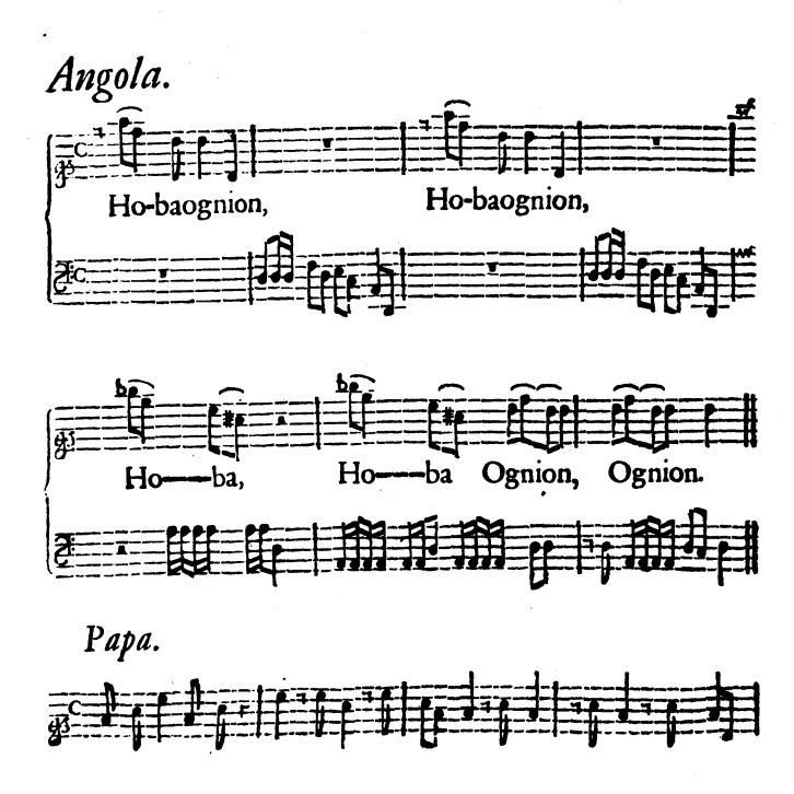
FIGURE I. Three African songs in Jamaica, 1688. The song titles refer to West African and central African ethnicities. From Hans Sloane, A Voyage to the Islands of Madera, Barbados, Nieves, St. Christopher and Jamaica..., vol. 1.

You must clap Hands when the Base is plaid, and cry, Alla, Alla.